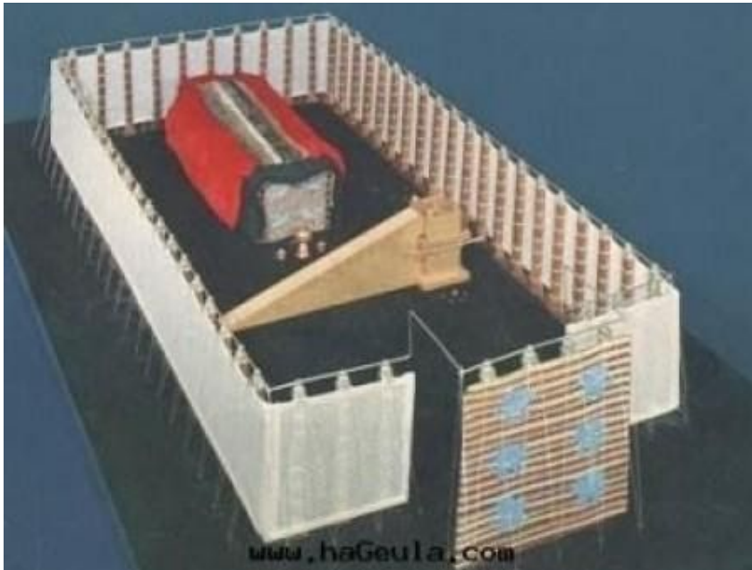
Overview of The Tabernacle

Parshat Vayakhel-Pekudei: Our double Parsha, which contains the detailed instructions for the construction of the Tabernacle, as well as the clothing of the priests, is best described in pictures, rather than words, so please see attached images.